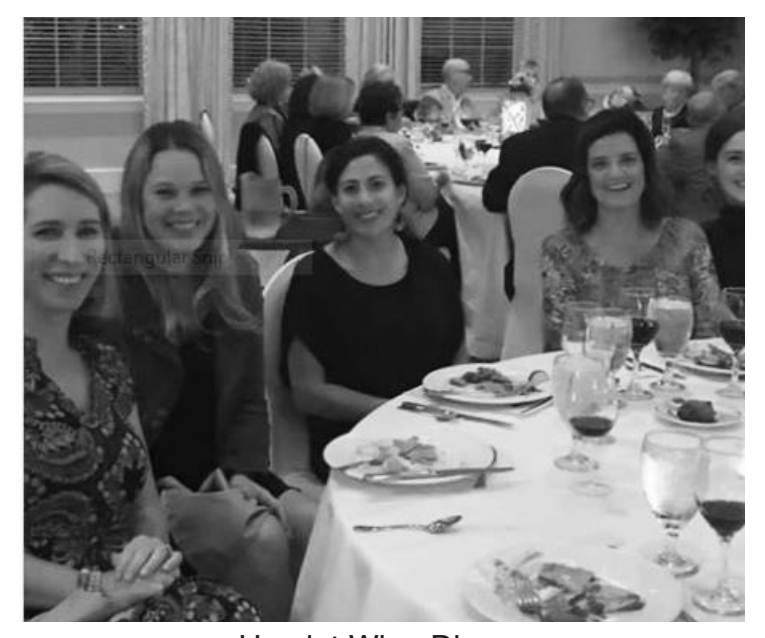
Hamlet Wine Dinner