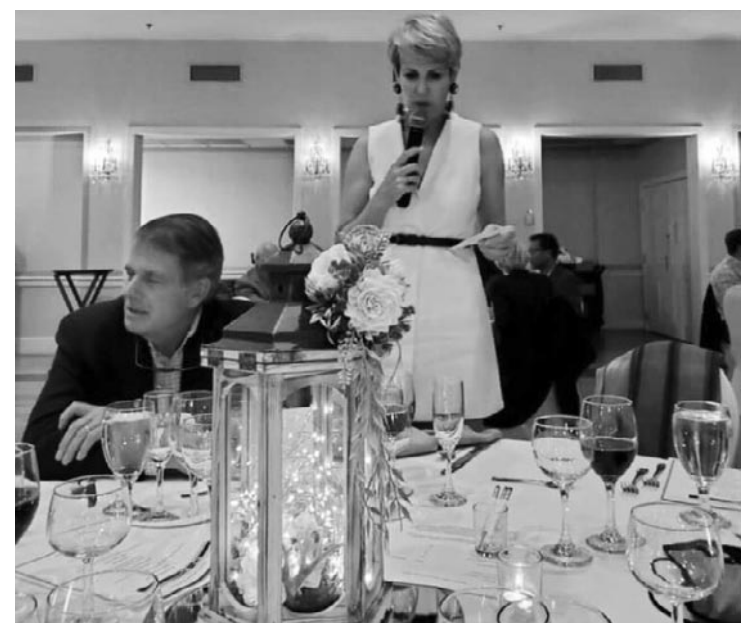
Hamlet Wine Dinner