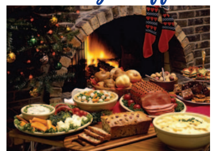
December 22, 2019 11:30 am - 2:00 pm

Adults $24++ • Children (4-11) $12.00++ • Children 3 & Under Complimentary